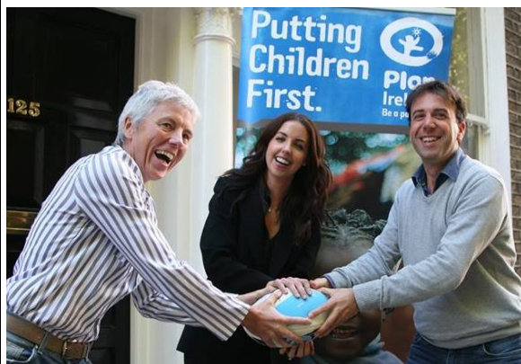
Plan2Inclusivize – Togo, Africa

In partnership with international children's charity, Plan International Ireland and the CARA Centre (National Adapted Physical Activity Centre Ireland) the UNESCO Chair, IT Tralee has developed a pioneering sports inclusion programme and toolkit called 'Plan2Inclusivize' for use in developing countries to promote participation and inclusion in sports among children and adults with disabilities. Children with disabilities across West Africa are subject to profound levels of poverty, exclusion and discrimination. They are widely excluded from education and denied access to protection