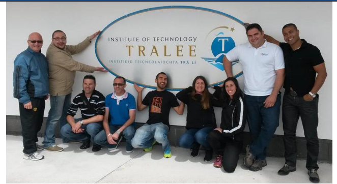
Maltese Sports Council visit IT Tralee

Work shadowing was coordinated for each member of the group at Cappanlea Outdoor Education & Training Centre; the Regional Sports and Leisure Centre in Tralee; the Aquadome; the GAA Gaelic Sports office; and the Run the Kingdom organisation. These organisations coupled with the academic staff of Health & Leisure Department, IT Tralee showcased the importance of collaboration between higher education and the business world.