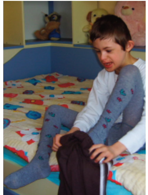
Argentina. • Korea. • Romania.