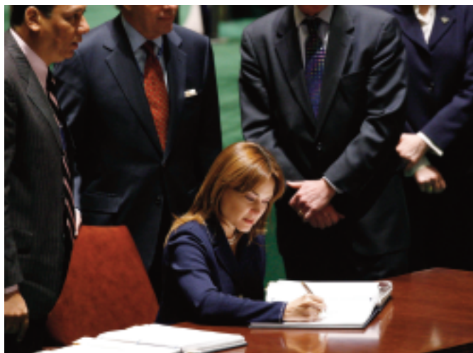
New York.

In 2007, the United Nations passed a new law. It says people with disabilities have the same rights as everyone else. It says all people with disabilities are equal before the law. It says this applies to women and girls, and children with disabilities, too.