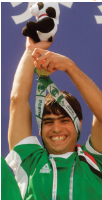
Iraq.

Give time for each person to make a list (with help, if needed) of things they like to do (basketball, reading, concerts, etc). Collect and read lists aloud one at a time. Everyone guesses who made that list. Afterwards, ask, “How did you guess? What do these lists tell us about a person?” and “How do these things make us who we are?”