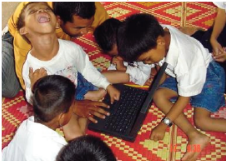
Cambodia.

Gather as a large group. Have each pair share two or three thoughts. Ask everyone: Did any "worst experiences" violate the right to education? How?