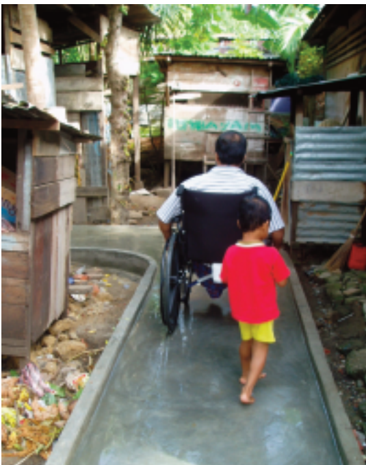
Indonesia.

Ask: "Was today's meeting accessible?" Make four teams, one each for "meeting space," "meeting notice," "transportation," and "meeting process." Ask each group: "When you look at who showed up for this meeting, what does it tell you about our own access?" Share results. Then ask, "How can we do better?" AND "How can our community do better?"