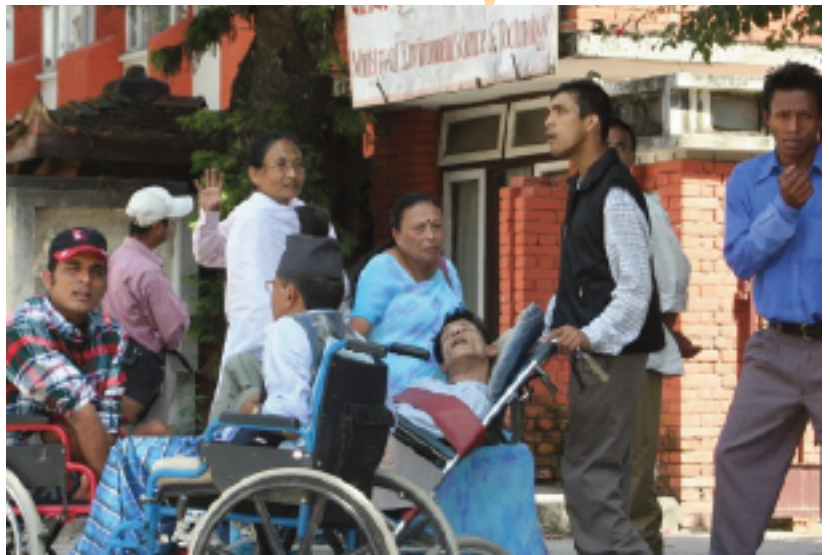
Nepal.

Pass out paper. Ask each person (with support) to draw a picture or write down one law they would like to have to protect their equal rights. Later, ask a local leader to come to your meeting. Each person can show and tell about their idea. Then discuss what laws you do have. Also talk about how to get new ones.