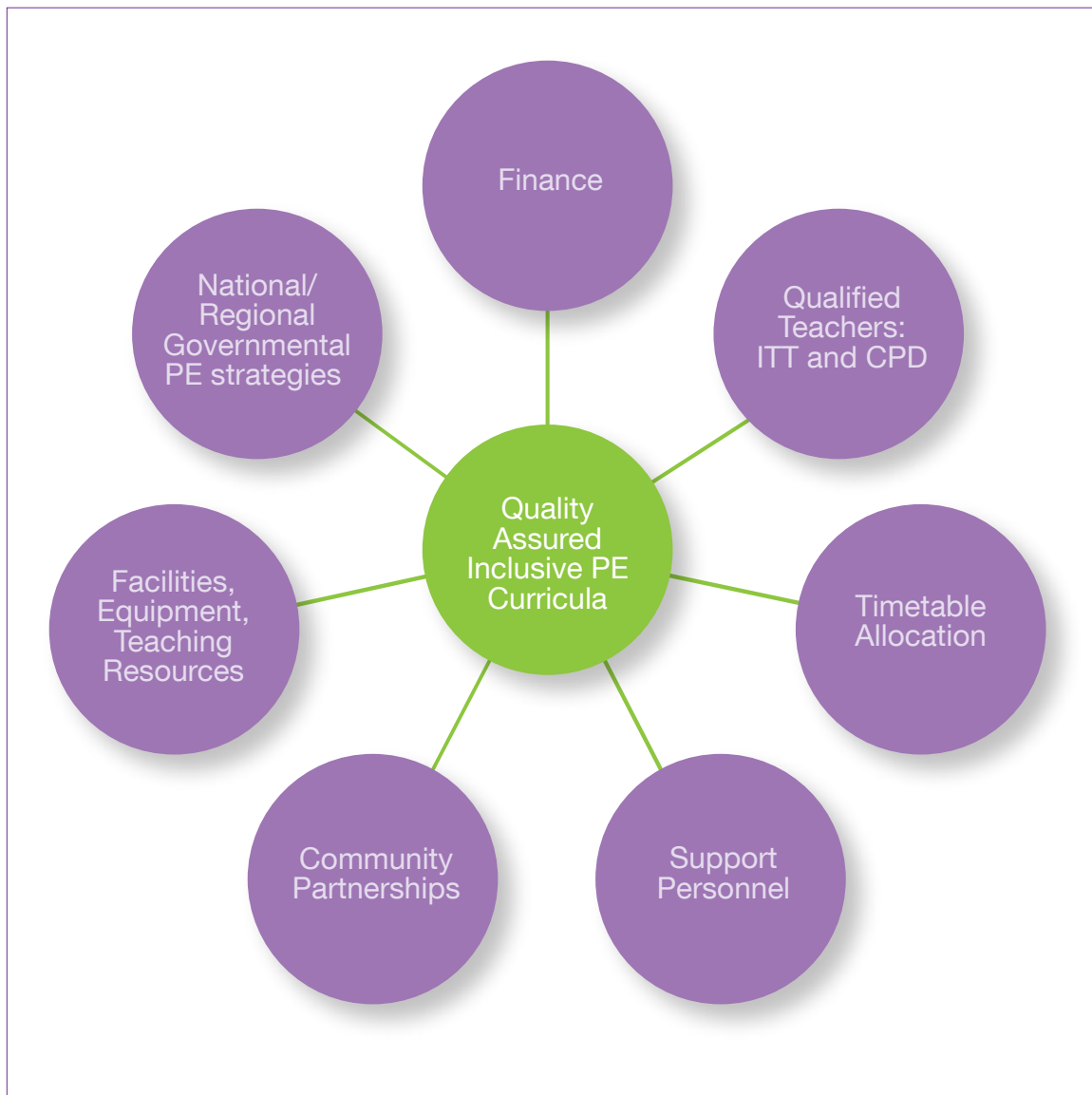
Figure 1. School Physical Education Basic Needs Model: Policy to Practice Infrastructure Template

The main findings of the Survey-generated data relevant to establishing basic needs are presented above in sections 1-7. The analysis of these findings together with analysis of qualitative information derived from items related to issues, concerns or problems as well as to specifically identified essential basic needs' requirements for inclusive quality physical education provision reported in Section 9 serve to provide an evidence-based platform for the formulation of a 'Basic Needs' Model.